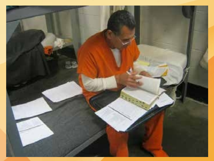
correspondence ministry designed to equip new believers in the basic fundamental doctrines for living the Christian life.

The Discipleship through Mail is our discipleship